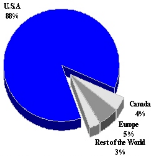
MONTHLY TOURIST ARRIVALS