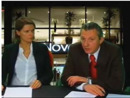
Accor Executives Announce Green Globe Certification of 400 Novotels on TravelMole.tv