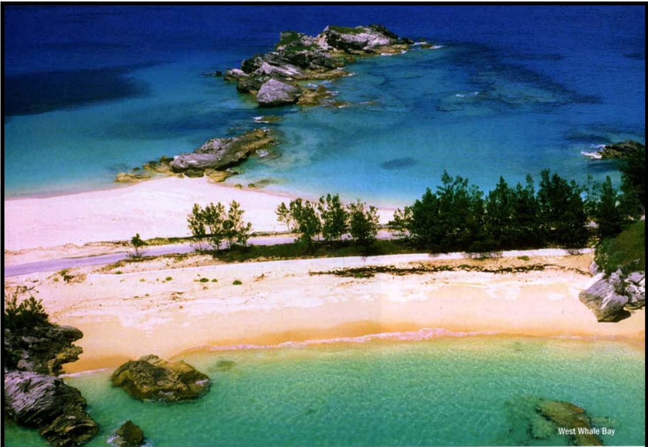
West Whale Bay