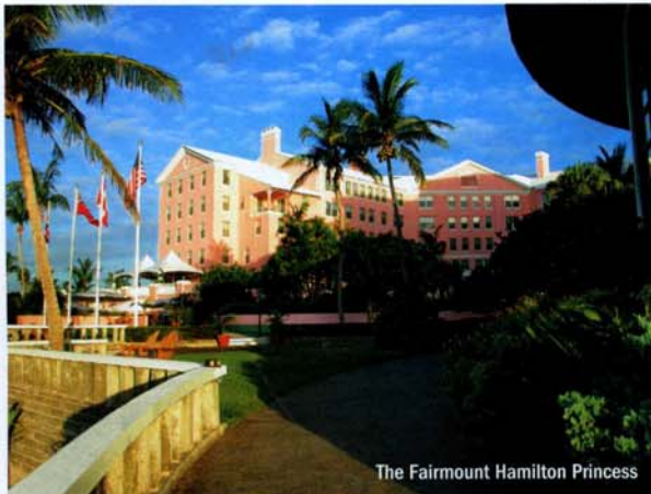
The Fairmount Hamilton Princess

JUST BECAUSE BERMUDA HAS BEACHES THE COLOR OF PINK BALLETTIGHTS does not mean it's not a manly enough place for the guys to gather for a fishing getaway. OK, they wear Bermuda shorts and knee socks, too, you say. Granted, but Bermudians also drive on the wrong side of the road (that's the left side if you're wondering), which is a pretty macho thing to do, not to mention the male factor manifested by their serious love affair with motor scooters and really big boats.